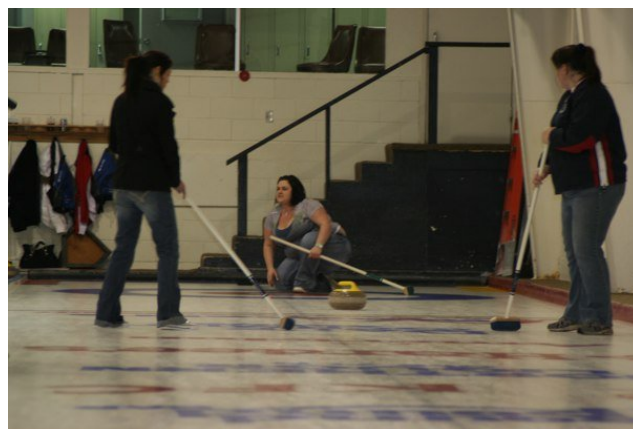
The Bemidji Jaycees Curling Team.