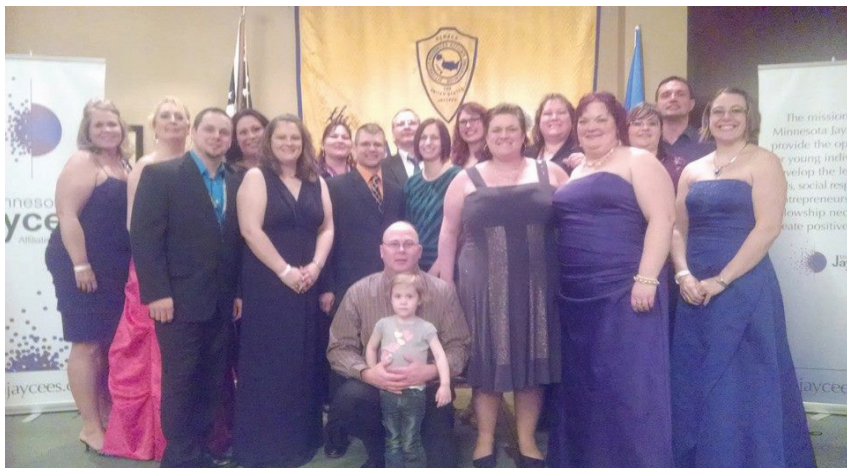
At the January convention Awards Banquet. Aren't we a foxy bunch?