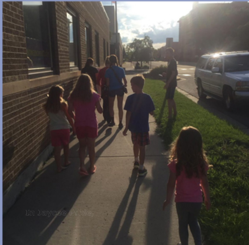
In Jaycee Pride,